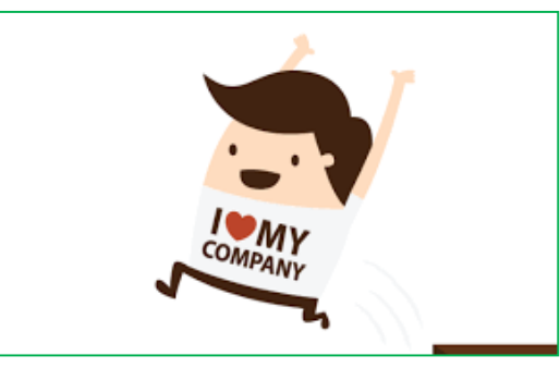
Are you sure your employees will say this.